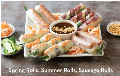
Spring Rolls, Summer Rolls, Sausage Rolls