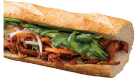
Grilled Pork Banh Mi