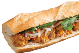
Meatball Banh Mi